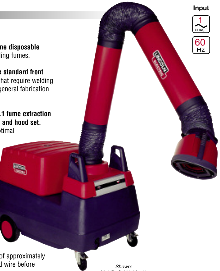
Shown: Mobiflex™ 200-M with optional Extraction Arm